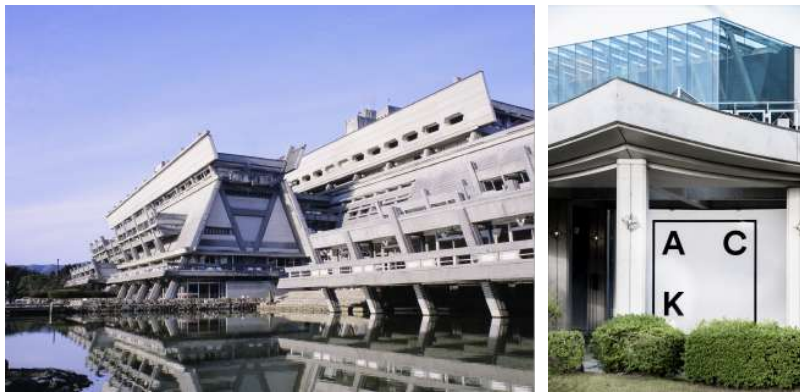
Exterior of Kyoto International Conference Center / ACK Entrance